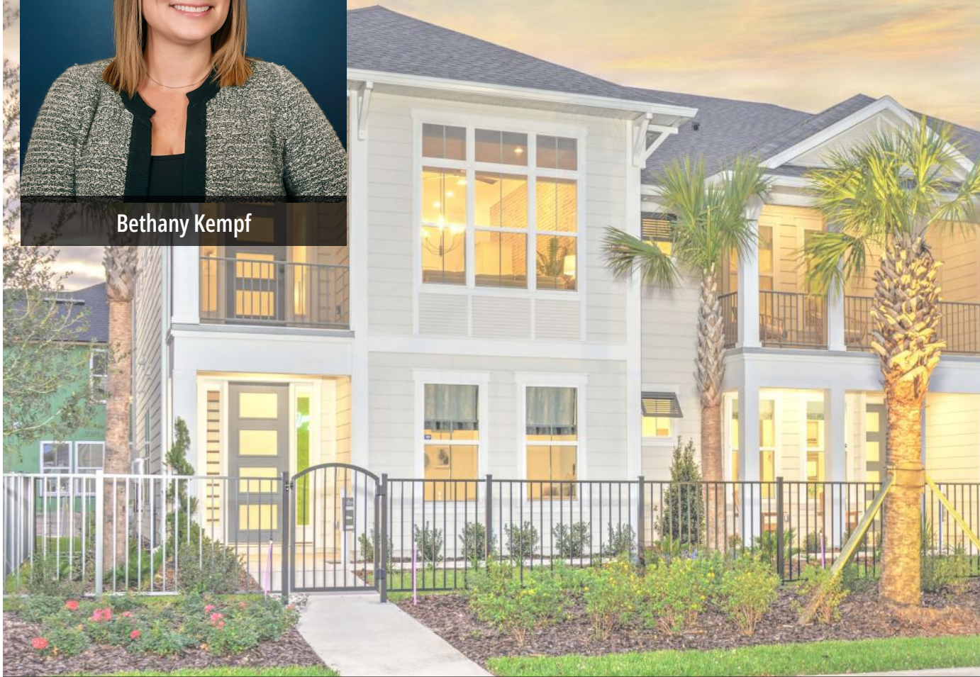
THE BARTRAM - B at NOCATEE