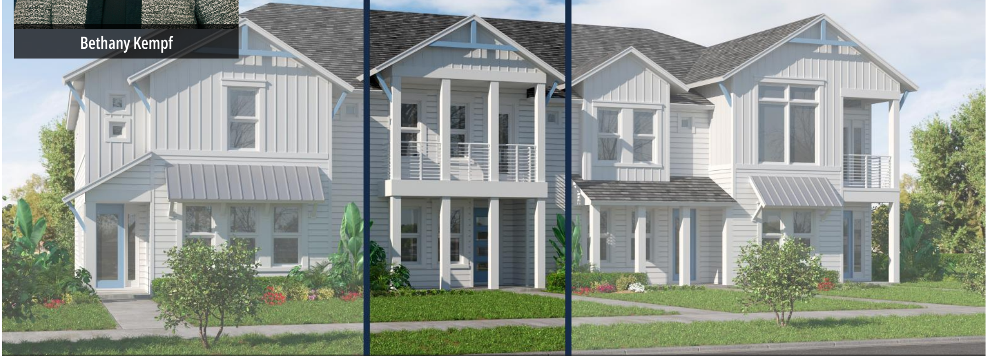
THE CASTILLO - C at NOCATEE