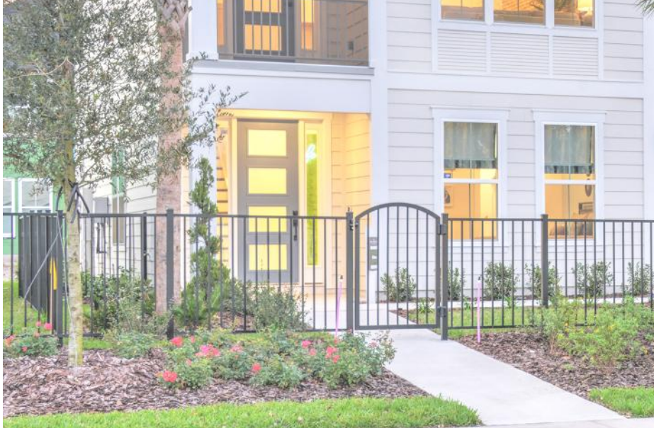
THE CASTILLO - C at NOCATEE