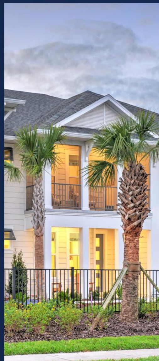
THE CASTILLO - WEST INDIES