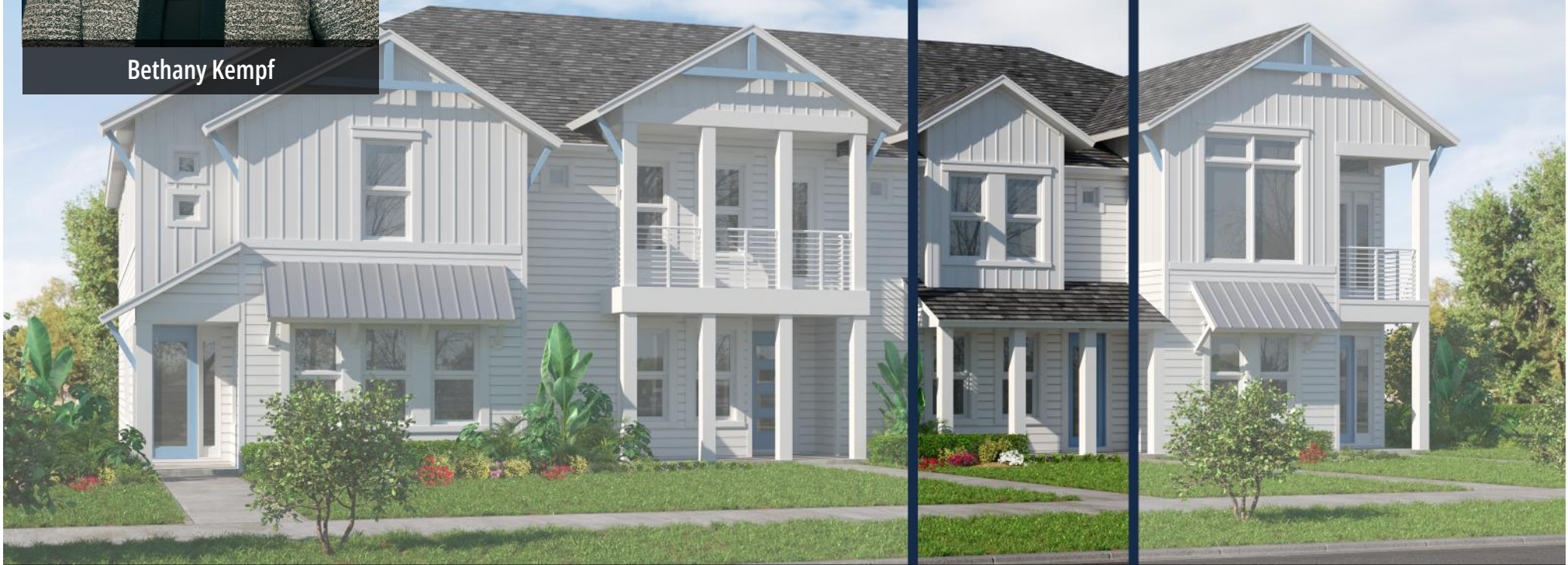
THE DELEON - D at NOCATEE