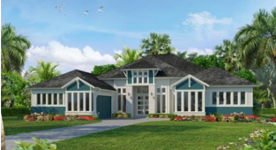
THE COASTAL MODERN - TILE

Living Area: 3,495 ft 2 Under Roof: 5,059 ft 2