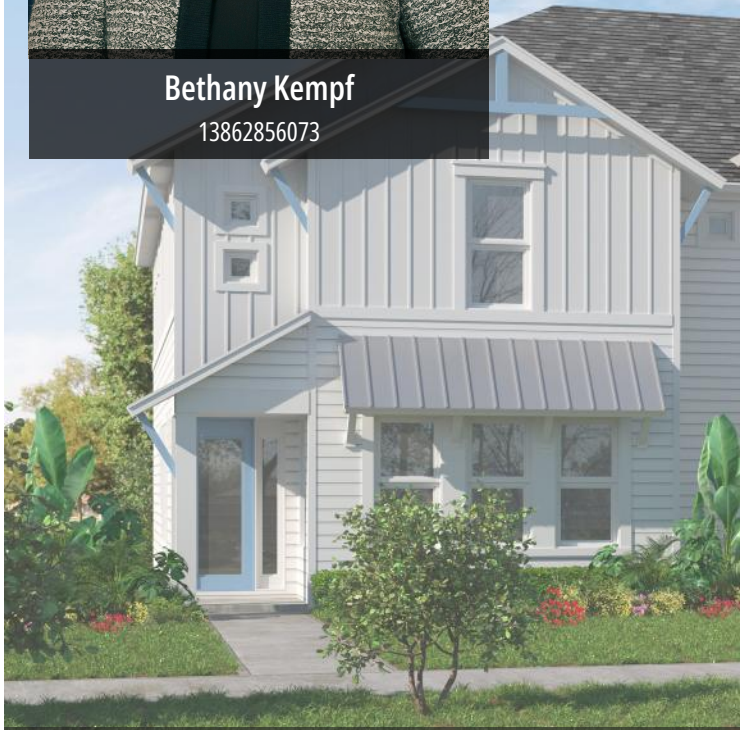
THE CASTILLO - C at NOCATEE