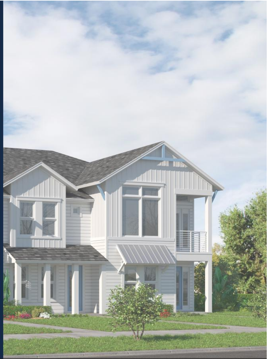
THE CASTILLO - FARMHOUSE